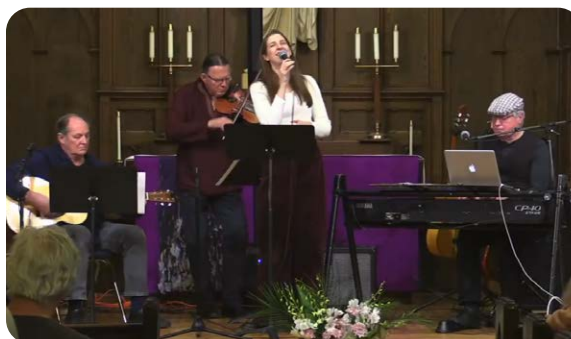
Contemporary Music Faculty