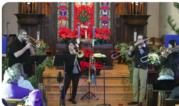
The Paper Clips Trombone Quartet