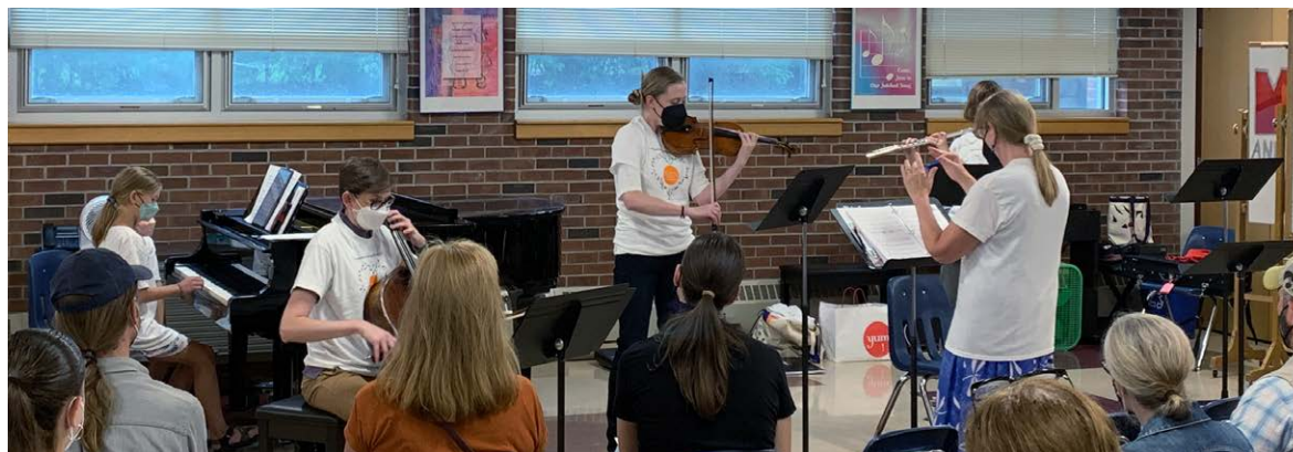
Composition Camp for Girls+

Our Summer Camp – a longtime, beloved tradition at SPCM – continues to provide two weeks of musical exploration and friendship. Students have the opportunity to build upon their existing skills, but also the chance to try brand new approaches including songwriting, introduction to a variety of instruments, and ensembles including choirs, rock bands, and orchestra.