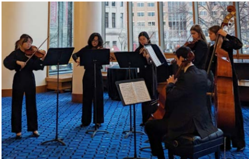
Purple Crayon Sextet Winner Performance