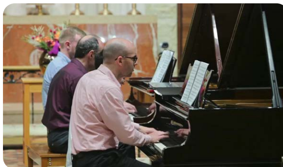
2 Pianos, 8 Hands

Wednesday, May 10, 2023 at Unity Church-Unitarian