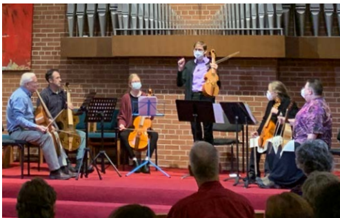
Fall 2022 Adult Recital